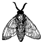
Figure 2: A sample black and white graphic that has been resized with the includegraphics command.

of tables, use the environment figure* to enclose the figure and its caption. And don't forget to end the environment with figure* , not figure !